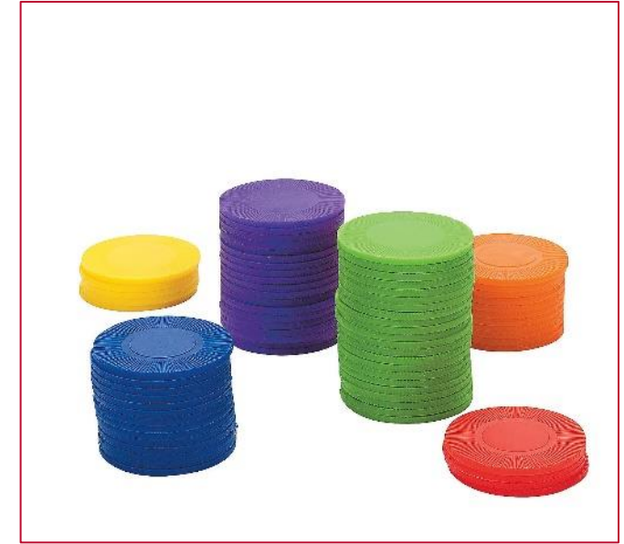
Food Chips 3 x Green 3 x Red