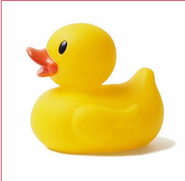
Ducks 9 x Yellow 1 x Pink